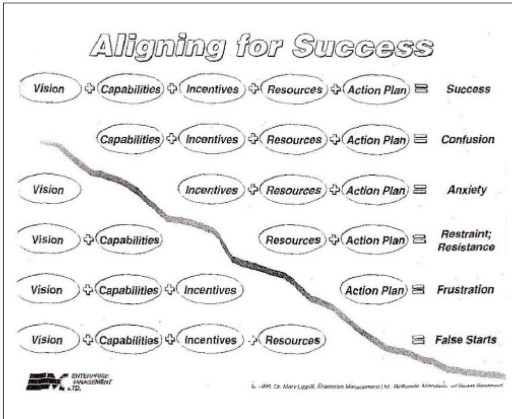
Diagram 1B: Lippitt’s “Aligning for Success”

changing parlance in her field; (4) she changed the title of the diagram; and (5) added a decorative diagonal line.